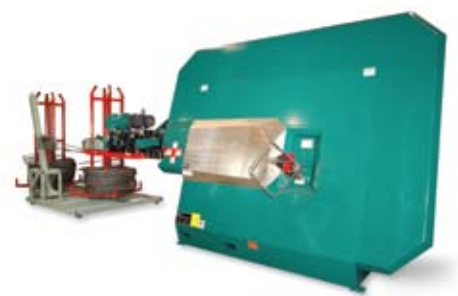
5 STIRRUP BENDERS