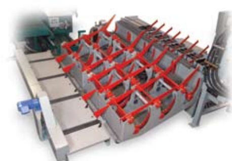
3 BAR TRANSFER SYSTEMS