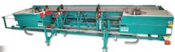
4 AUTO BAR BENDERS