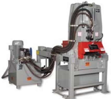
2 CUTTING SYSTEMS