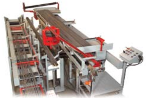
1 MATERIAL HANDLING SYSTEMS