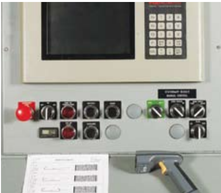
2D Bar Coding Optional