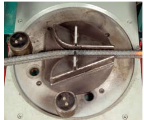
Handles column offset bars easily with optional tooling