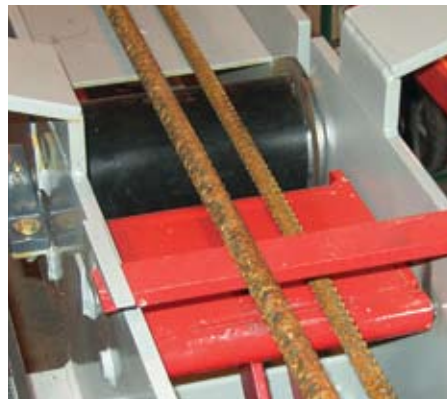
Guards Not Shown