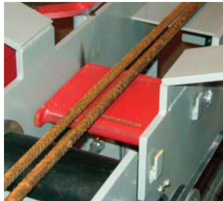
Guards Not Shown