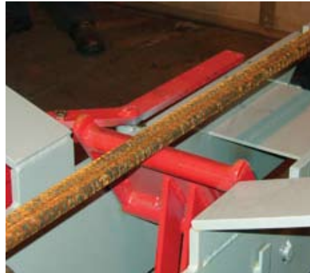
KRB Preloaded System (optional)