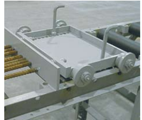
Adjustable gauge table