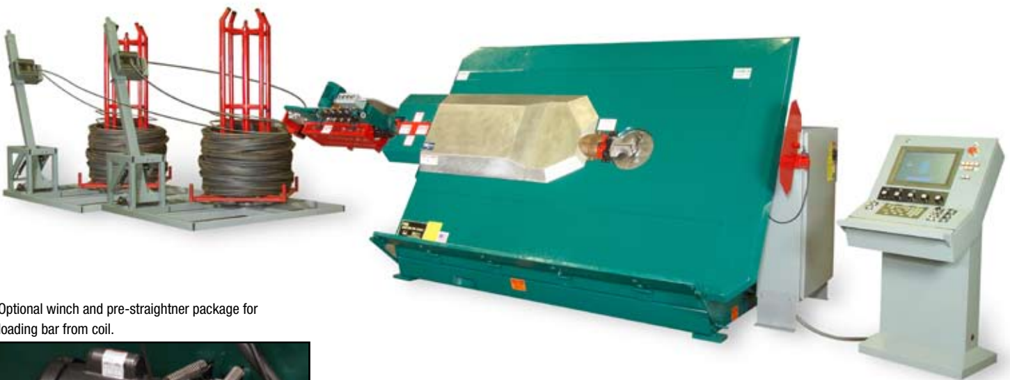
Optional winch and pre-straightner package for loading bar from coil.