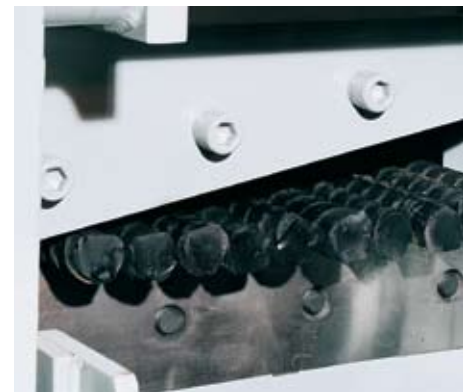
10 pieces of #11 (35mm) bars. Guard removed to show detail.