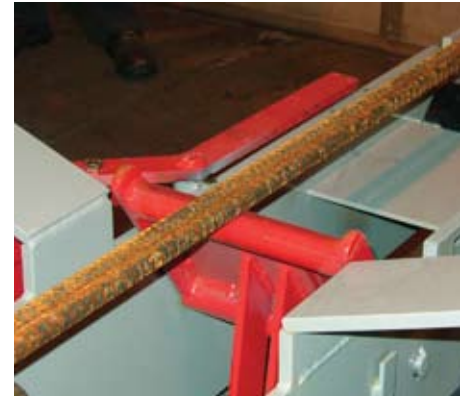
KRB Preloaded System