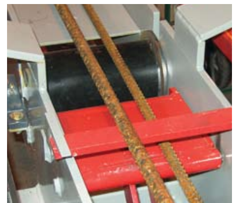
Guards Not Shown