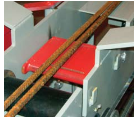
Guards Not Shown